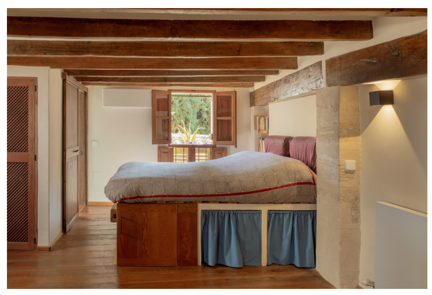
PALMA MARKETS MALLORCA REAL ESTATE